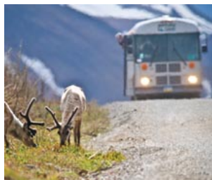
The Tundra Wilderness Tour is a top choice for wildlife viewing.

People may visit Alaska for a variety of reasons, but it is the adventures they experience when they are there -- often in the form of day trips -- that are the lifeblood of tourism to the Great Land. Clients love these thrill-seeking dalliances with the final frontier, and it's easy to understand why: Such trips invigorate so intensely that they are known to produce a noticeable zest in the steps of even the most sedate tourists.